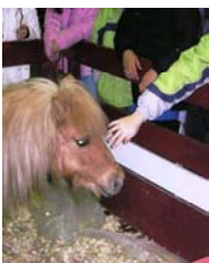
Farm animals, and tractors, are always a hit at AgDays. Local FFA Chapters assist by caring for the animals.

Public officials are welcome to drop by anytime between the hours of 9 and noon on any of the three days.