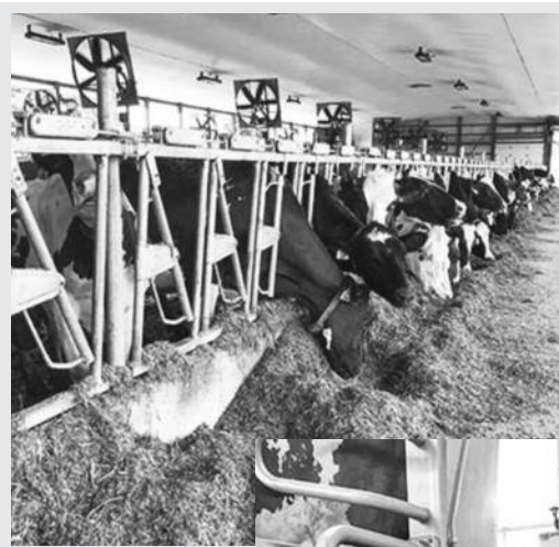
Lenkaitis Holsteins Dairy Farm features a new freestall barn that include curtains and fans controlled by temperature sensors to increase cow comfort.