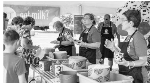
KCFB Foundation volunteers scooped ice cream for the hungry crowd at the Dairy Open House as part of a 10,000 Gallon CHALLENGE, dairy-focused hunger relief campaign. See full story on page 1.