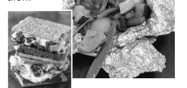
S'mores and campfire stew

Bury it in campfire coals. Cooking time is about 1 hour. You can eat it right out of the foil, or empty it into a dish.