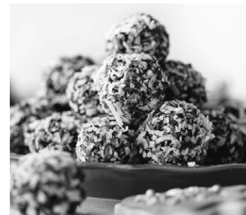
◀ No-bake Chocolate Snowballs DIY Cinnamon ornaments ▶

Meanwhile, pulse the remaining coconut in a food processor to break it down. It's easier to