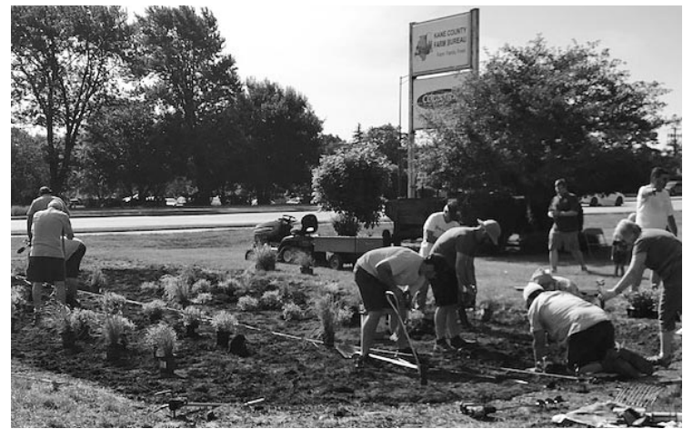
Kane County Farm Bureau will be awarded an American Farm Bureau Federation “County Activities of Excellence” Award for 2020 for their “Public Planting-Pollinator/Rain Garden” project. Volunteers will travel to Atlanta in January to share the idea with Farm Bureau members from across the nation.

volunteer planting in the spring/summer of 2022, by calling KCFB at 630-584-8660.