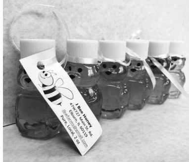
Left: Sweet and savory treats including hot sauce, popcorn, pepper jam, soaps and Teeple Barn mug