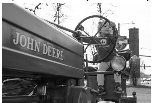
Touch-A-Tractor - the name says it all! Dozens of hands-on activities, tractors and fun entice the whole family. Come on out to the Farm Bureau to celebrate the coming of spring, April 8-10, 2022.

Volunteers willing to assist with Story time or other Touch-A-Tractor activities are encouraged to contact Steve or Kelcee at the Kane County Farm Bureau, 630-584-8660, or to return the form at right.