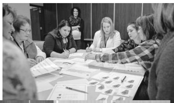
Top: Agricultural Literacy Coordinators from County Farm Bureaus around the state were shown new classroom resources at meetings in Bloomington and DeKalb in February.

"Think of how you make it (agriculture) relate to everything you do," Daugherty said. "Think of all the stuff you do and how powerful it is."