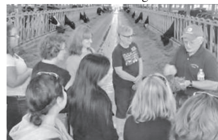
Kane County Farm Bureau's Summer Ag Institutes are an excellent opportunity for teachers to learn about many aspects of agriculture and obtain ideas and lessons to take back to their classrooms.