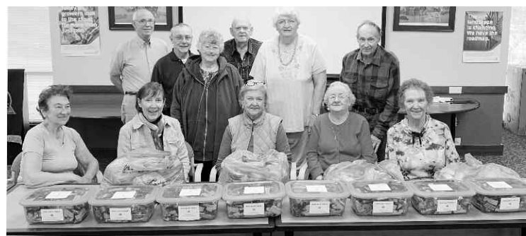
Farm Bureau members gathered on October 16 at the KCFB office on Randall Road to prepare Safety Treats for farmers and farm workers.