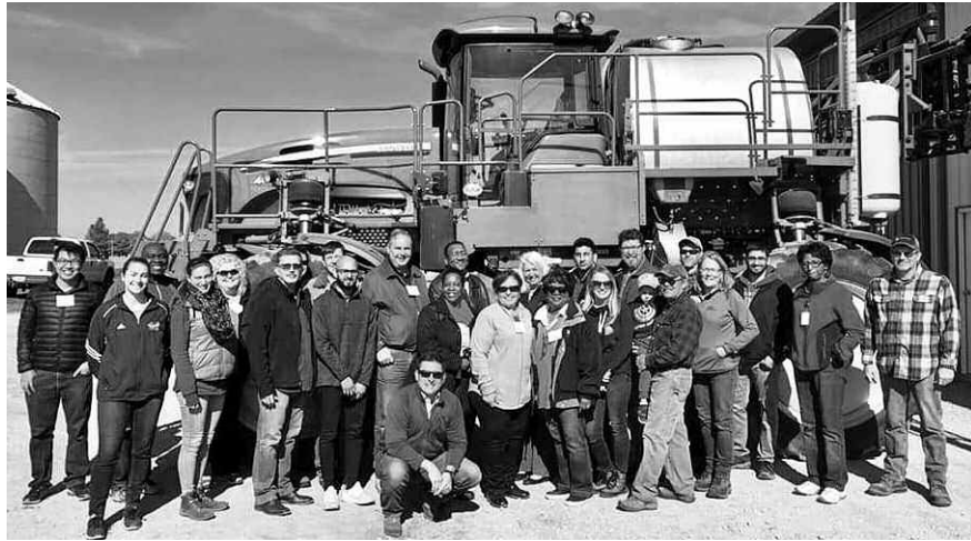
Ingredion employees pause for a picture in front of a sprayer after their farm "shop talk" and combine/tractor rides.