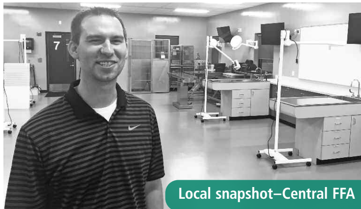
Local snapshot—Central FFA

In addition, annual donors include agribusiness partners and individuals with an interest in supporting the future of agriculture. For information on how individuals can contribute, visit www.iaafoundation.org or contact the Kane County Farm Bureau at 630-584-8660. For information on IAITC resources and activities, visit www.agintheclassroom.org .