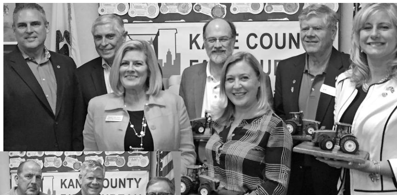
Above: Seven Northern Illinois State Legislators recognized by ACTIVATOR as "Friends of Agriculture" were presented awards at the Kane County Farm Bureau following a BBQ dinner on Thursday, September 1. Pictured (left to right) are Representative